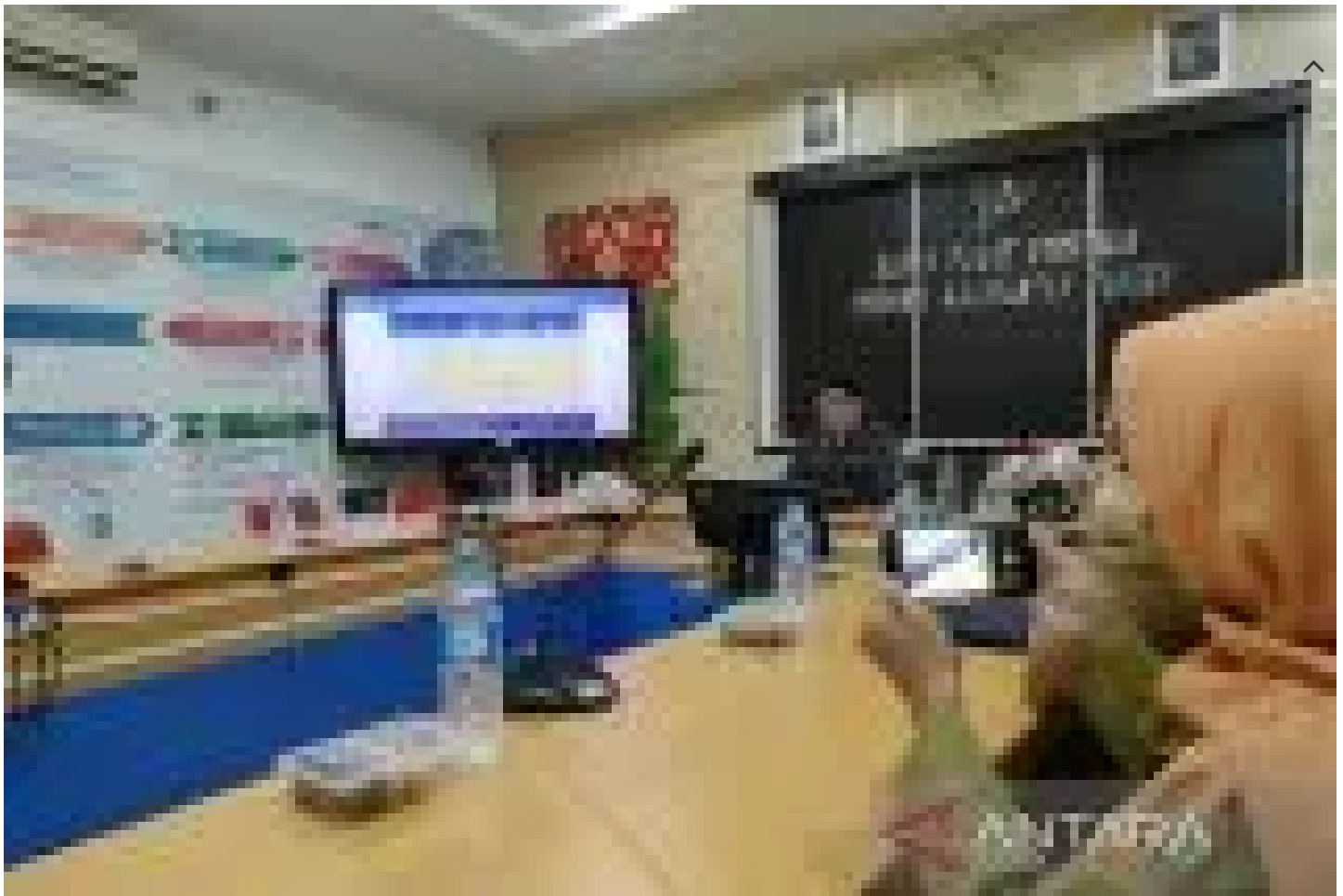
( https://kalteng.antaranews.com/berita/615900/bps-penduduk-miskin-di-kalteng-alami-penurunan-349-ribu-orang )

BPS: The poor population in Central Kalimantan has decreased by 3.49 thousand people ( https://kalteng.antaranews.com/berita/615900/bps-penduduk-miskin-di-kalteng-alami-penurunan-349-ribu-orang )