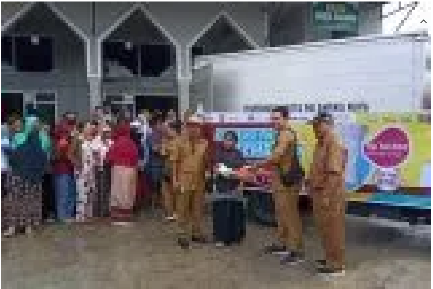
( https://kalteng.antaraneews.com/berita/615918/pemkot-salurkan-beras-bersubsidi-bantu-tekan-inflasi-di-palangka-raja )

The municipal government distributes subsidized rice to help reduce inflation in Palangka Raya ( https://kalteng.antaraneews.com/berita/615918/pemkot-salurkan-beras-bersubsidi-bantu-tekan-inflasi-di-palangka-raja )